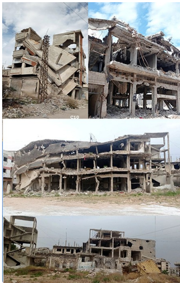
Figure 2 - Completely destroyed buildings that require removal DOI: https://doi.org/10.23670/IRJ.2023.132.35.2