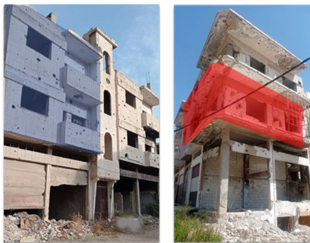
Figure 3 - The differences in damage between property owners DOI: https://doi.org/10.23670/IRJ.2023.132.35.3

- Citizen disagreement on priorities and needs causes difficulty in reaching consensus on what needs to be done, creating new disturbances among participating parties. The image shows differences in damage between property owners (see figure 3).